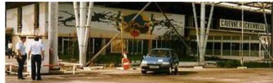
Above: Police Nationale at the Rochambeau International Airport in Cayenne, French Guyana.

There are three other Latin American countries not already mentioned, though one of the, French Guyana, is actually part of Europe since it is a state of France just like Alaska is a state of the United States of America. That means that police in French Guyana are the regular French Gendarmerie and the Police National. Its officers/members are recruited from France and all French territories. Everyone completes their training in France and then is first assigned to one of the large cities in France before they can apply for transfer to its territories or overseas possessions.