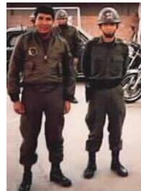
Left: Bolivian National Police Lieutenant

Until 2010 the Policía Nacional trained it’s officer candidates (2 nd Lieutenant career entry) in the „Academia de Policías,” but after a scandal involving pay-offs to buy admission into the 3 year academy, admission to the academy was suspended during the year 2010 and this year (2011) the 73 year old institution reopened as a reformed „Universidad Policial“ that is affiliated with the national university system.