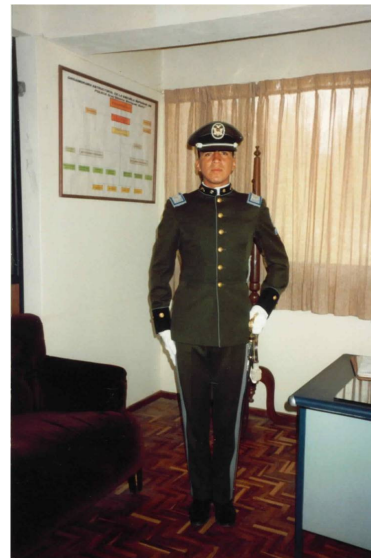
A cadet at the Advanced Police Academy